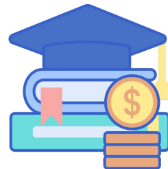
$5,000.00 Total Scholarships

The Madison Area USBC awarded a total of $5,000.00 to these applicants. They were selected for their distinguished service as bowlers, scholars, and volunteers.