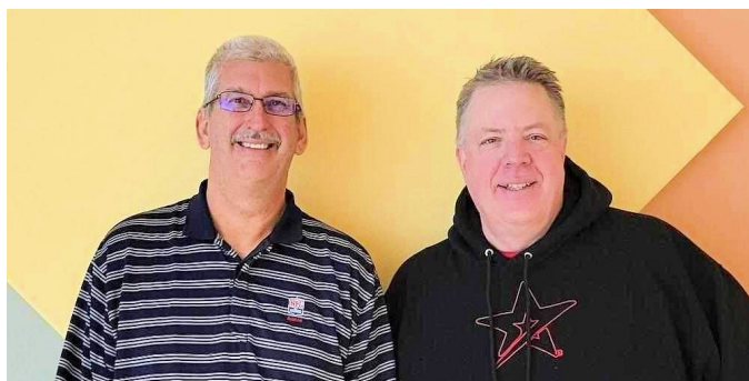
Allen / Erce 1477