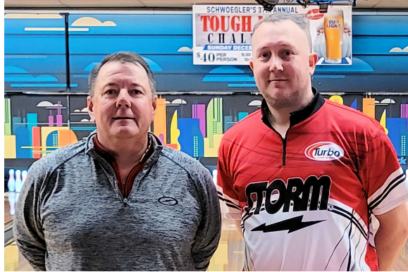
Myers / Eoff 1478